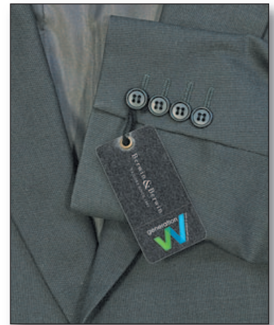
□ An agreement between The Merino Company and suit manufacturer Berwin & Berwin will see the company's tailored suits distributed to UK department stores, retail boutiques, as well as featuring in more than 50 House of Fraser stores.